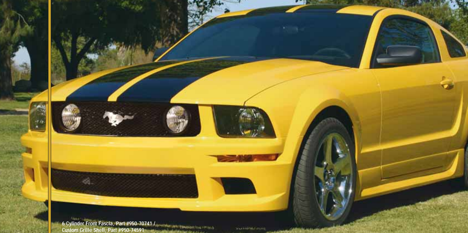
6 Cylinder Front Fascia, Part #950-70741 / Custom Grille Shell, Part #950-74591