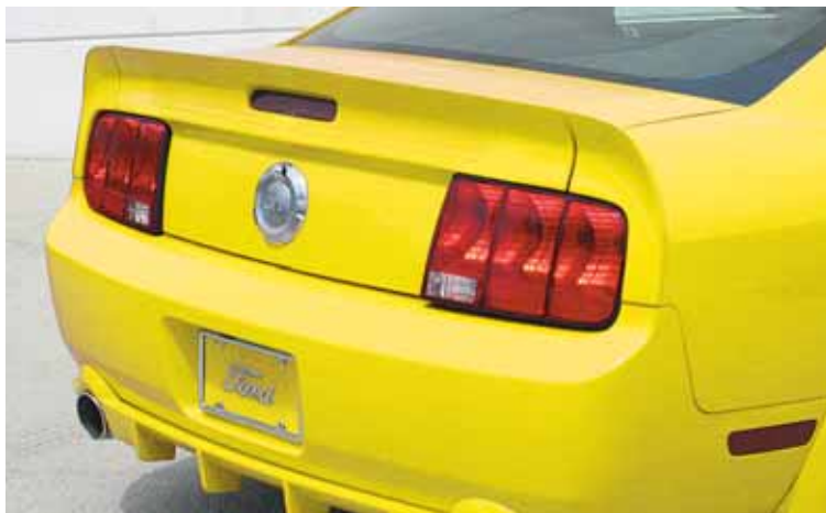
Gen. 1 Three Piece Spoiler, Part #950-70745

to create a dual exhaust. However, that upgrade is less popular at the dealership level. Knowing this Street Scene developed a rear valance, which successfully meets either demand. The Street Scene Rear Valance comes with one finished exhaust port and a second hidden exhaust port. If the vehicle is modified with split exhaust the installer merely trims the outlined second exhaust port area, to unveil the hidden port. The modification can be accomplished in a matter of minutes and is clearly marked on the part.