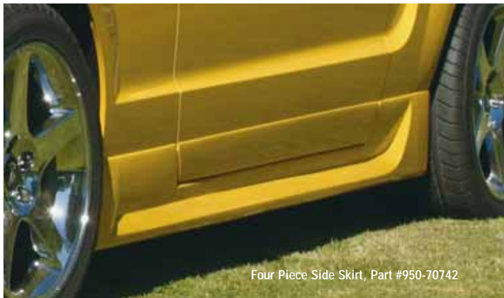
Four Piece Side Skirt, Part #950-70742