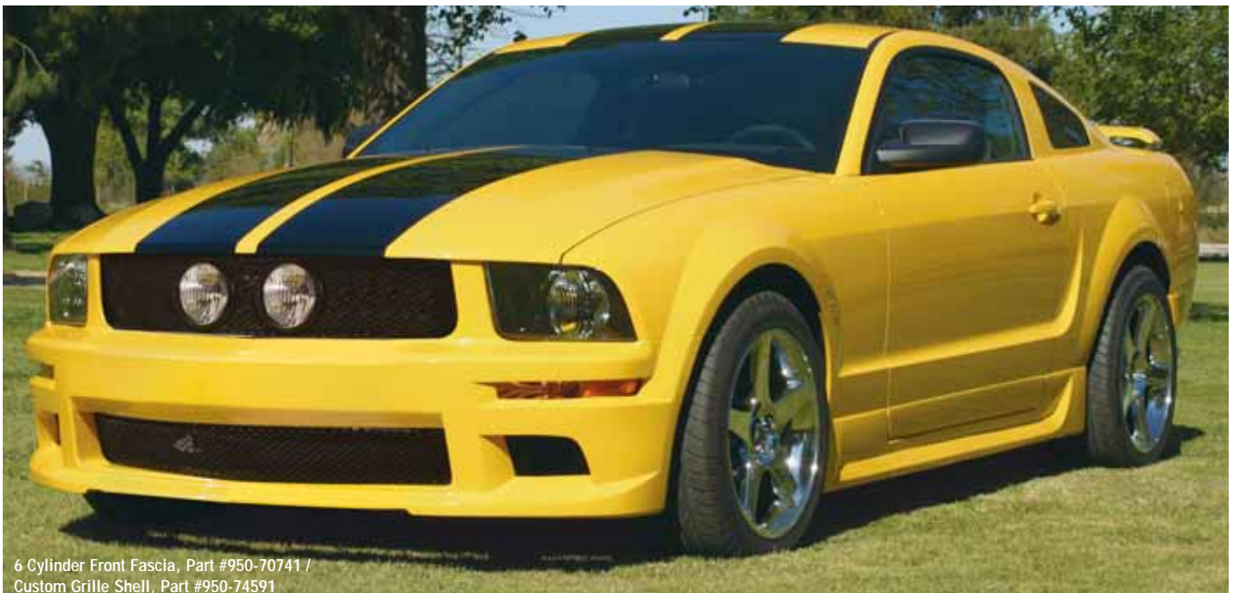
6 Cylinder Front Fascia, Part #950-70741 / Custom Grille Shell, Part #950-74591

The finishing touch for the Mustang is the three-piece "Mach style" trunk tail spoiler. The spoiler is injected in a rigid urethane, which helps it maintain shape in any weather. The spoiler is developed with the third brake light cut-out to insure safety. All pieces are taped in place using 3M double back automotive grade tapes.