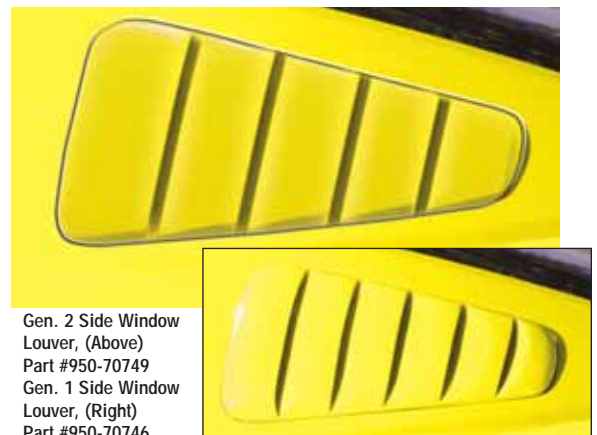
Gen. 2 Side Window Louver, (Above) Part #950-70749 Gen. 1 Side Window Louver, (Right) Part #950-70746