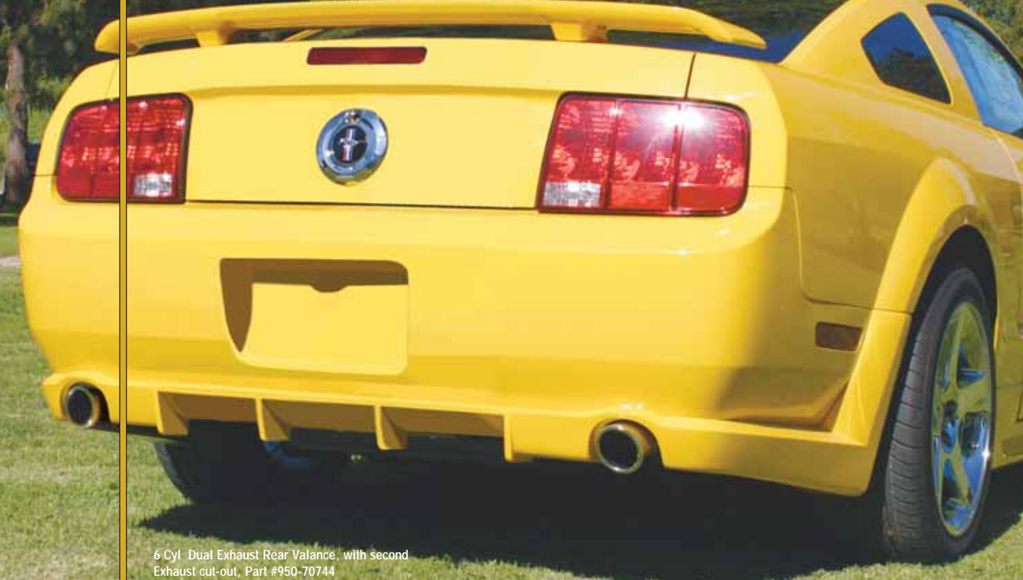
6 Cyl. Dual Exhaust Rear Valance, with second Exhaust cut-out, Part #950-70744