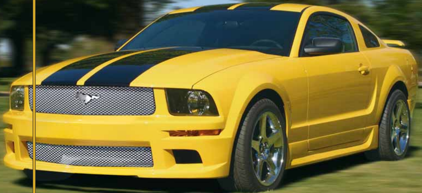
6 Cylinder Front Fascia, Part #950-70741 / Custom Grille Shell, Main Part #950-77931, Lower Part #950-77928